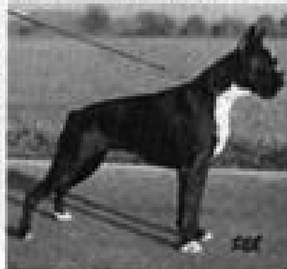
Ch. Gracia del Colle dell'Inferno — proved to be an excellent producer