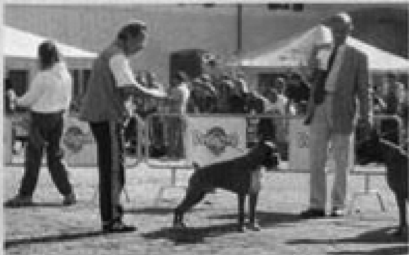
Ch. Ace and Ch. Collo dell'Inferno at the recent Italian Boxer Club Show