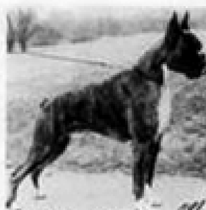
Ch. Tito del Colle dell'Inferno A true sire in Europe

In 1990 Ch. Tack (by Miso out of Ch. Florida) was born. Tack was also World Youth Champion and an Airtex Champion. He spent the first part of his life in Italy, then he