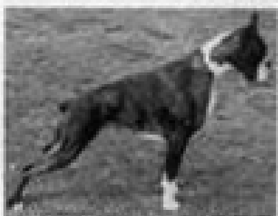
Ch. Fritz — Jahressieger and Best in Show at the German Boxer Club Jahresvieger Show