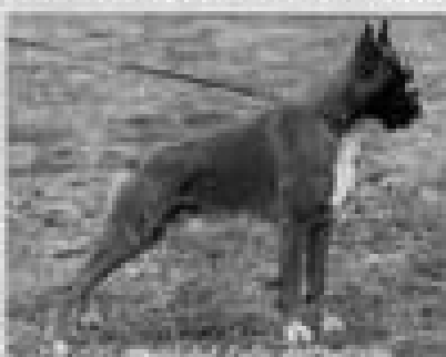
TASSO DEL COLLE DELL'INFINITO