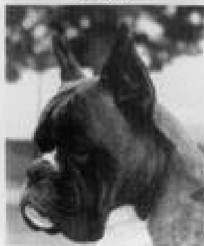
Head stud of Totto