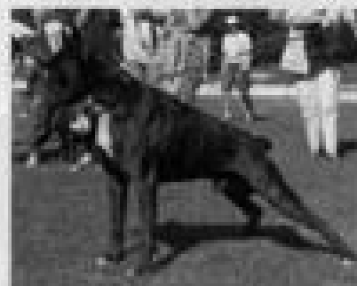
THE GREAT OLIMPIA DEL COLLE DELL'INFINITO