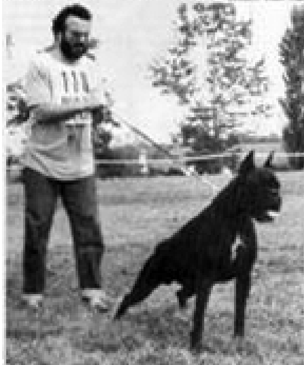
Famous with Ch. Tito del Colle dell'Inferno

Two years later Ch. David (Ch. Tack del Colle dell'Inferno x Ch. Playa del Colle dell'Inferno) came along, and followed a career similar to Tack, living in the same countries. David has won many titles, including World Champion.