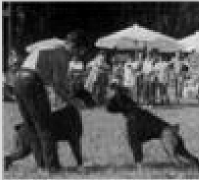
Ch. Doro del Colto alla Boveria

In 1994 Ch. Gauria won Arden and Ch. Totto was born. Totto is by Ch. Bino v al Cottaquello out of Gato del Colto dell'Infante. He has won practically every title it is possible for a Boxer to win. 1995 saw the arrival of Ch. Basso (Lido del Colto dell'Infante) ex Ch. Gauria del Colto dell'Infante and a year later it was the turn of Champion Zio, Gatto, Falso and the lovely baby Ufo.